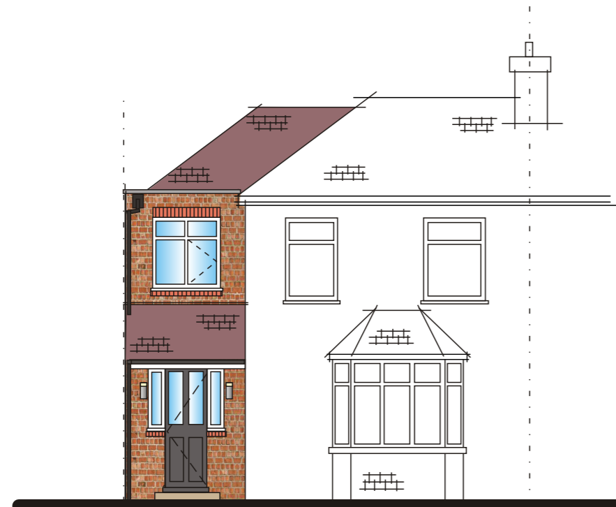
PROPOSED FRONT ELEVATION (NORTH)

PLEASE NOTE: PICTORIAL COLOURS ARE FOR GUIDANCE ONLY AND ARE NOT ACTUAL REPRESENTATIVES OF FINISHED MATERIALS.