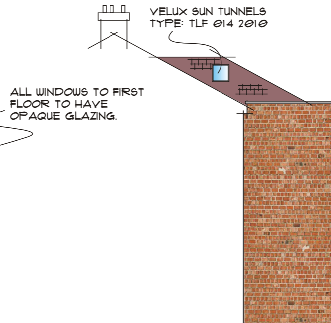
PROPOSED SIDE ELEVATION (WEST)